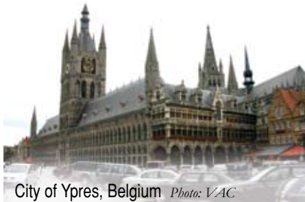
City of Ypres, Belgium