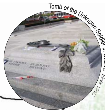
Tomb of the Unknown Soldier in Ottawa