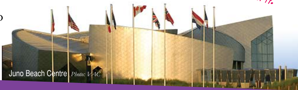
Juno Beach Centre