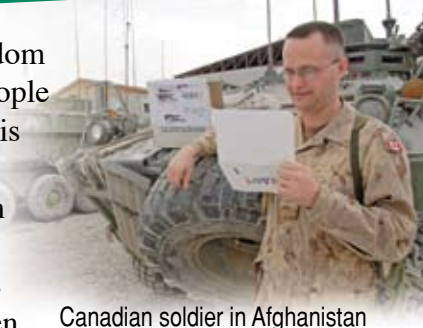
Canadian soldier in Afghanistan reading a letter from home.