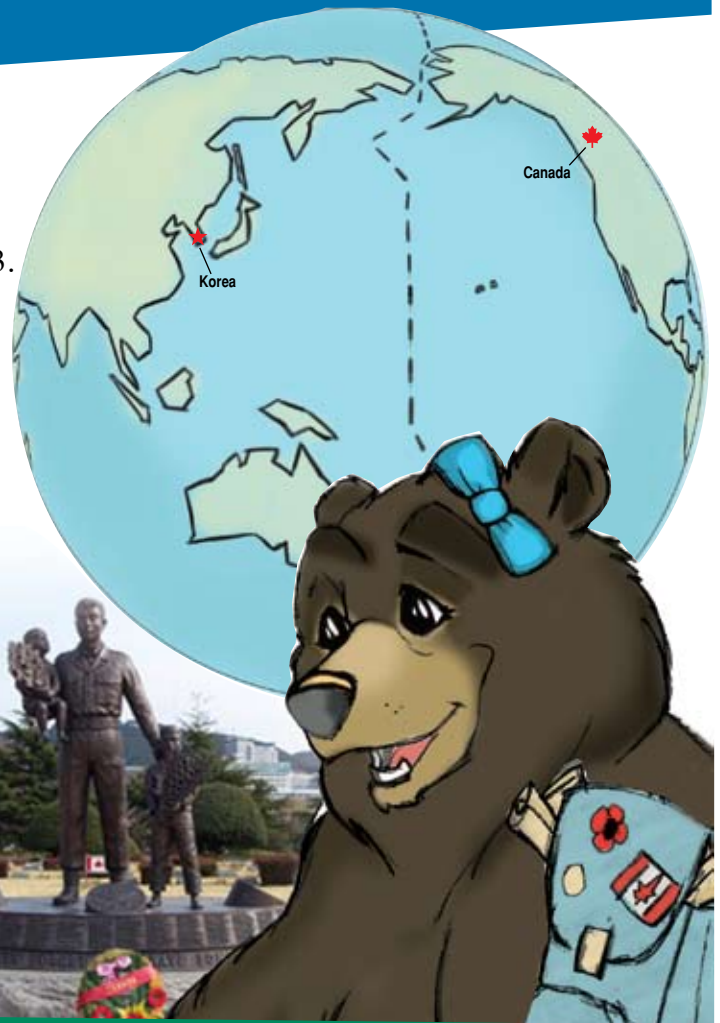
Monument to Canadian Fallen

“Hey, why don’t we put a picture of the monument on a wall of our Clubhouse?” Win asks. “And since monuments really help us remember, let’s hold our ceremony at the cenotaph down the street!”