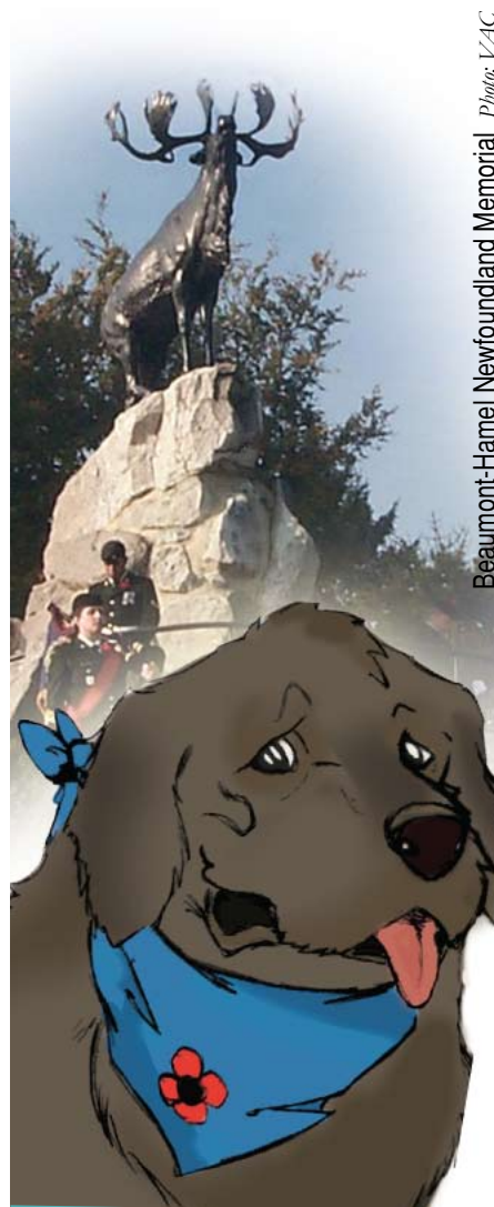
Beaumont-Hamel Newfoundland Memorial