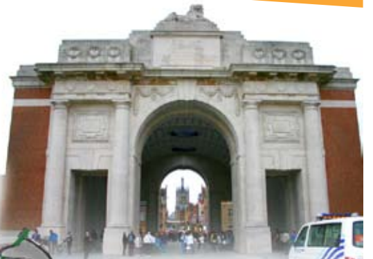
Menin Gate, in Ypres

Ellie is excited they are going to have their own remembrance ceremony, as she will play The Last Post . Ellie is going to practice very hard to make sure she does a good job. Maybe one day, she could play at Menin Gate!