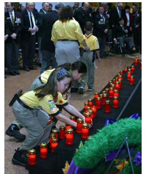
Students taking part in a Candlelight Ceremony.